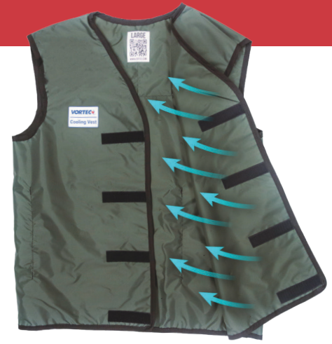
COLD AIR DISTRIBUTION

The distributed air temperature differential is +/- 60°F (33°C) from the compressed air inlet temperature.